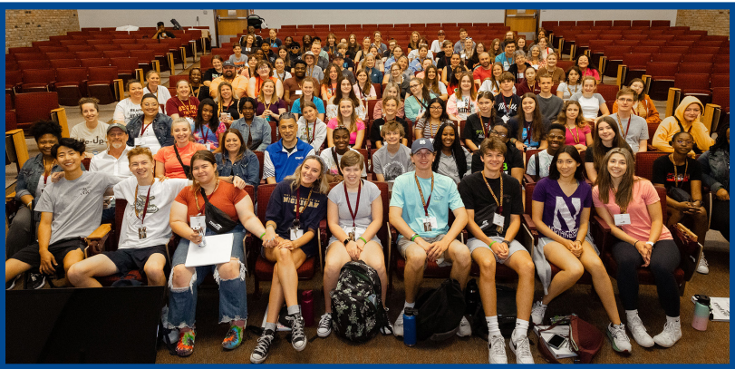
Students connect with YAC peers around the state while attending the 2023 Michigan Youth Grantmakers Summer Leadership Conference.

This document is housed on the Council of Michigan Foundations website ( michiganfoundations.org ). Should adjustments to datasets emerge, they may be reflected in subsequent downloads of this PDF.