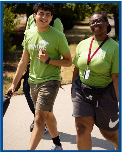
Students connect with YAC peers around the state while attending the 2023 Michigan Youth Grantmakers Summer Leadership Conference.

The average number of grants made during the year, per YAC, in last year's Databook was 12 grants.