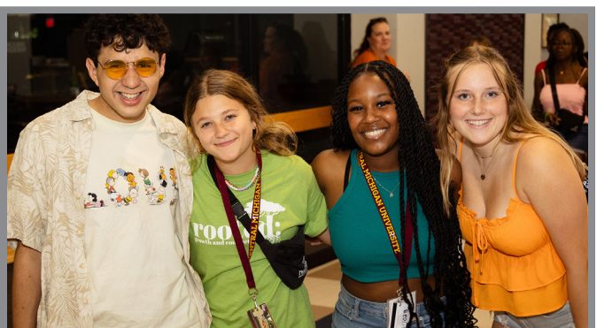
Students connect with YAC peers around the state while attending the 2023 Michigan Youth Grantmakers Summer Leadership Conference.