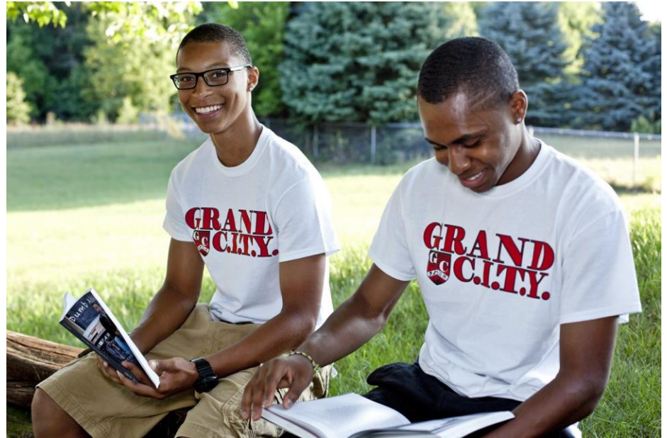
Grand C.I.T.Y. Sports/ Eric Tank Photography