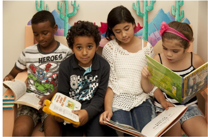
Grandville Avenue Arts and Humanities/ Eric Tank Photography